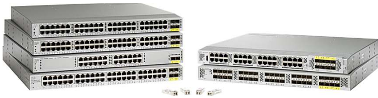
Figure 2. Cisco Nexus 2000 Series Fabric Extenders from Bottom Left to Top Right: Cisco Nexus 2148T, 2224TP GE, 2248TP GE, 2248TP-E, 2232TM 10GE, and 2232PP 10GE; Cost-Effective Fabric Extender Transceivers for Cisco Nexus 2000 Series and Cisco Nexus Parent Switch Interconnect Are in Front of the Fabric Extenders

The Cisco Nexus 2000 Series provides two types of ports: ports for end-host attachment (host interfaces) and uplink ports (fabric interfaces). Fabric interfaces, differentiated with a yellow color, are for connectivity to the upstream parent Cisco Nexus switch.