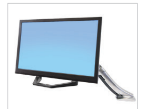
Monitor & Handle Kit (black) 97-760-009