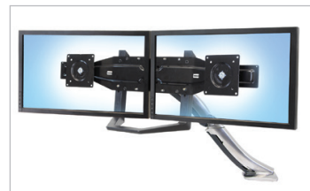
Dual Monitor & Handle Kit (black) 97-718-009