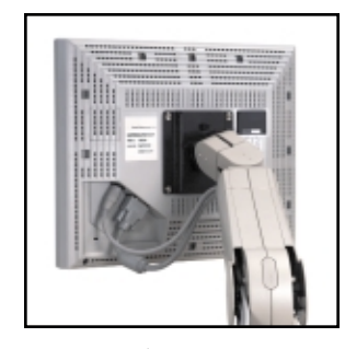
Pivot mechanism positions monitor where you need it.

All 400 Series Arms for vertical surfaces feature 180° of vertical adjustment.